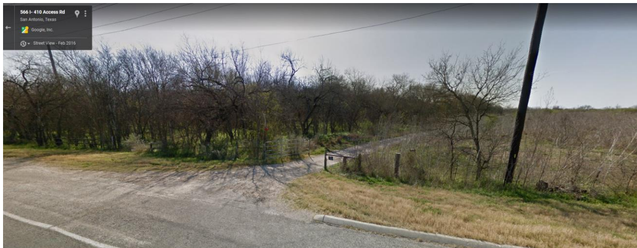
Figure 1: Street View of Meeting Location

Time: 2:00 PM, Wednesday, September 5th Location: Eastbound I-410 Access Road of SW Loop 410, San Antonio, TX Mapping Coordinates 29.318849, -98.571976 Between Somerset Rd and Palo Alto Rd